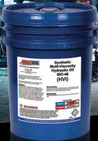
SYNTHETIC HYDRAULIC OIL