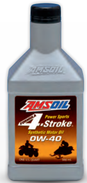
AMSOIL 0W-40 Formula 4-Stroke® Power Sports Synthetic Motor Oil