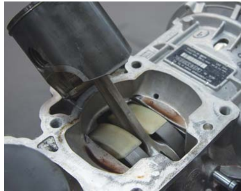
The pistons suffered only minor scuffing.